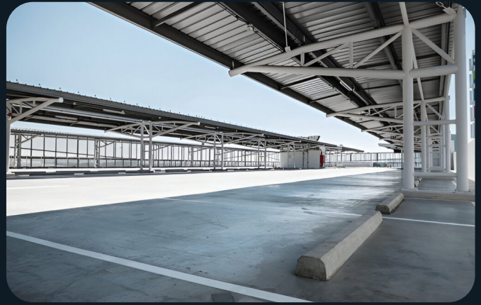
Parking Sheds & Shading Solutions