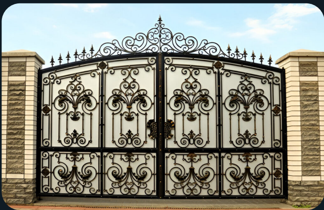
Gates, Railings & Fencing