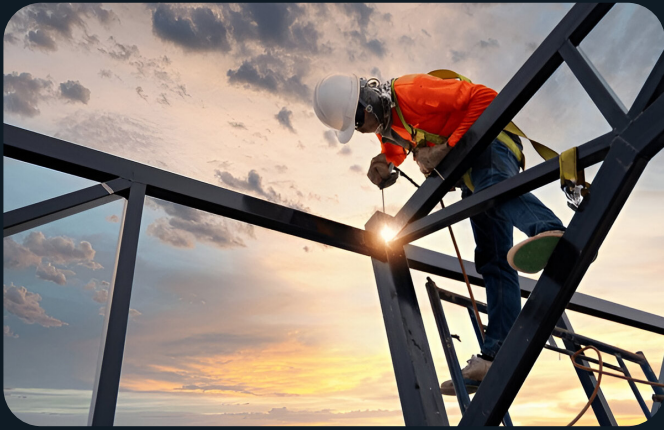
Steel Structures & Fabrication

At Spring Time Blacksmith & Welding Workshop, we specialize in delivering durable and innovative metal fabrication solutions tailored to the UAE market. From robust parking sheds and custom steel structures to precision gates, fences, and industrial welding works, our services are designed to combine strength, functionality, and aesthetics. With skilled craftsmanship, modern techniques, and a commitment to quality, we ensure every project meets the highest safety standards while adding long-lasting value to our clients' homes, businesses, and industries.