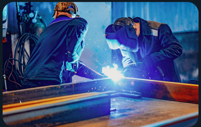
Custom Welding & Repair Works